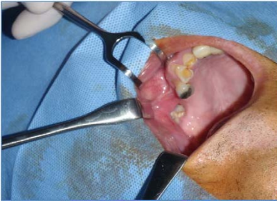
Figure 7: ORN of the upper jaw