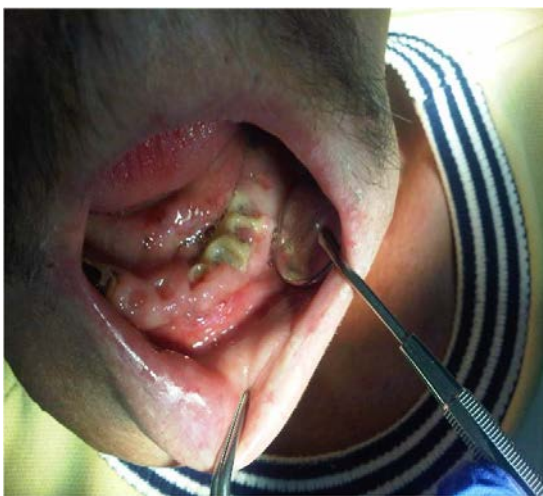
Figure 1: ORN of the mandible