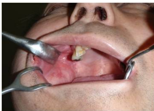
Figure 12: Status after 3 month