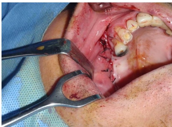
Figure 11: Closure of defect