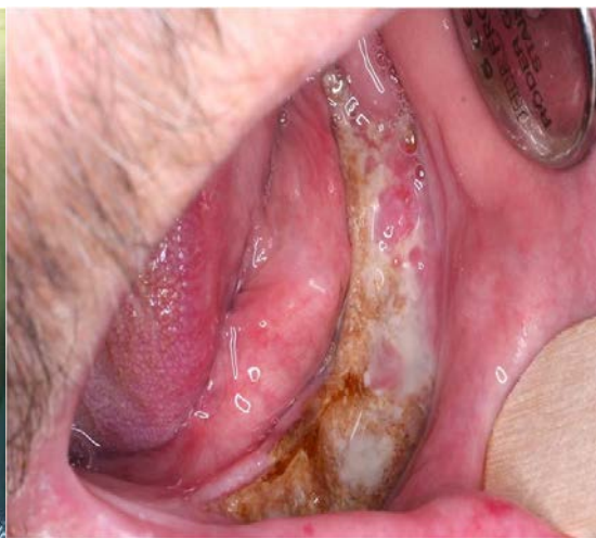
Figure 2: Result of the HBO therapy after 2 y.