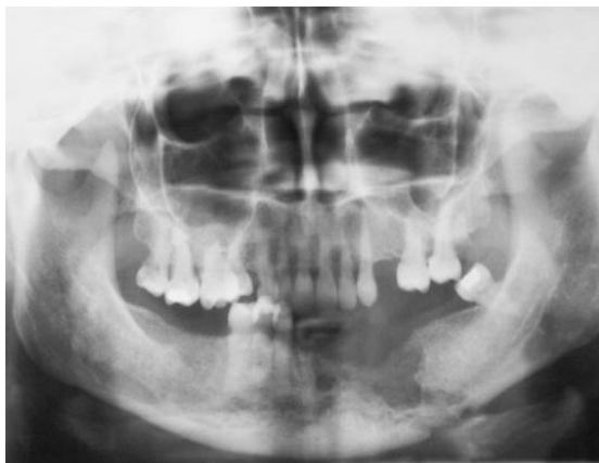
Figure 5: Pathological fracture of the mandible

initiation of radiotherapy and especially after its completion for compliance with the preventive programs and enhanced empirical experience. For these reasons there are now professional public accessible registers of osteoradionecrosis which are designed to record the newly established diagnosis and subsequent treatment. Developing ORNJ is variable and its etiopathogenesis is not until today thoroughly understood. Clinical studies aim to define the role and express the value of etiopathogenetic moments at the molecular and cellular level. Burke and his colleagues [23] recommends supporting the treatment by Pentoxifylline and vitamin E as an ideal antioxidant treatment at doses of 800mg Pentoxifylline and 1000 IU vitamin E for a minimum period of 6 month thereby supporting faster healing post radiation mucositis and soft tissue regeneration. Despite the potential risk of surgical treatment failure (immunocompromised patients, diabetes mellitus, pathological fracture etc.) the closure of sharp bone edges alveolar process appears to be the best solution.