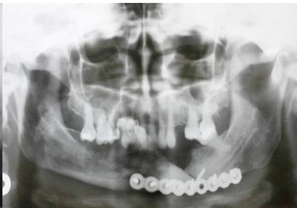
Figure 6: Osteosynthesis of the fracture

This type of treatment, however, must be preceded by strict hygiene training, patient motivation, and local debridement of necrotic bone parts. The issue of antibiotic prophylaxis is significant to help prevent infection after surgical intervention, but also the conventional extraction in the preventive face of treatment. British Association of Oral and Maxillofacial Surgeons recommend using and applying antibiotic prophylaxis in the pre surgical preparation but also in the post operative period. Despite these results, it can be stated that no global consensus on the choice, timing and length antibiotic treatment was declared [24]. ORNJ of oncological patients do not develop immediately, but after a certain time. After radiotherapy the possibility of necrosis is partly expected and the patient is informed. When recurrence of cancer after prior radiation poses a high risk to ORNJ without the possibility of surgical salvage patients face the choice between palliative chemotherapy and re-irradiation [25]. It is very encouraging that the number of ORNJ is declining due to the application of preventive measures before and during treatment with ionizing radiation [26].