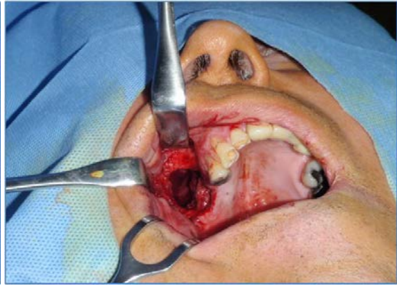
Figure 8: Extensive surgery necrectomy