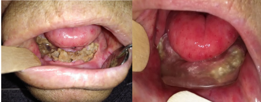
Figure 3: Extensive ORN of the mandible