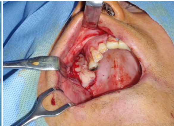
Figure 10: Application of the PRP