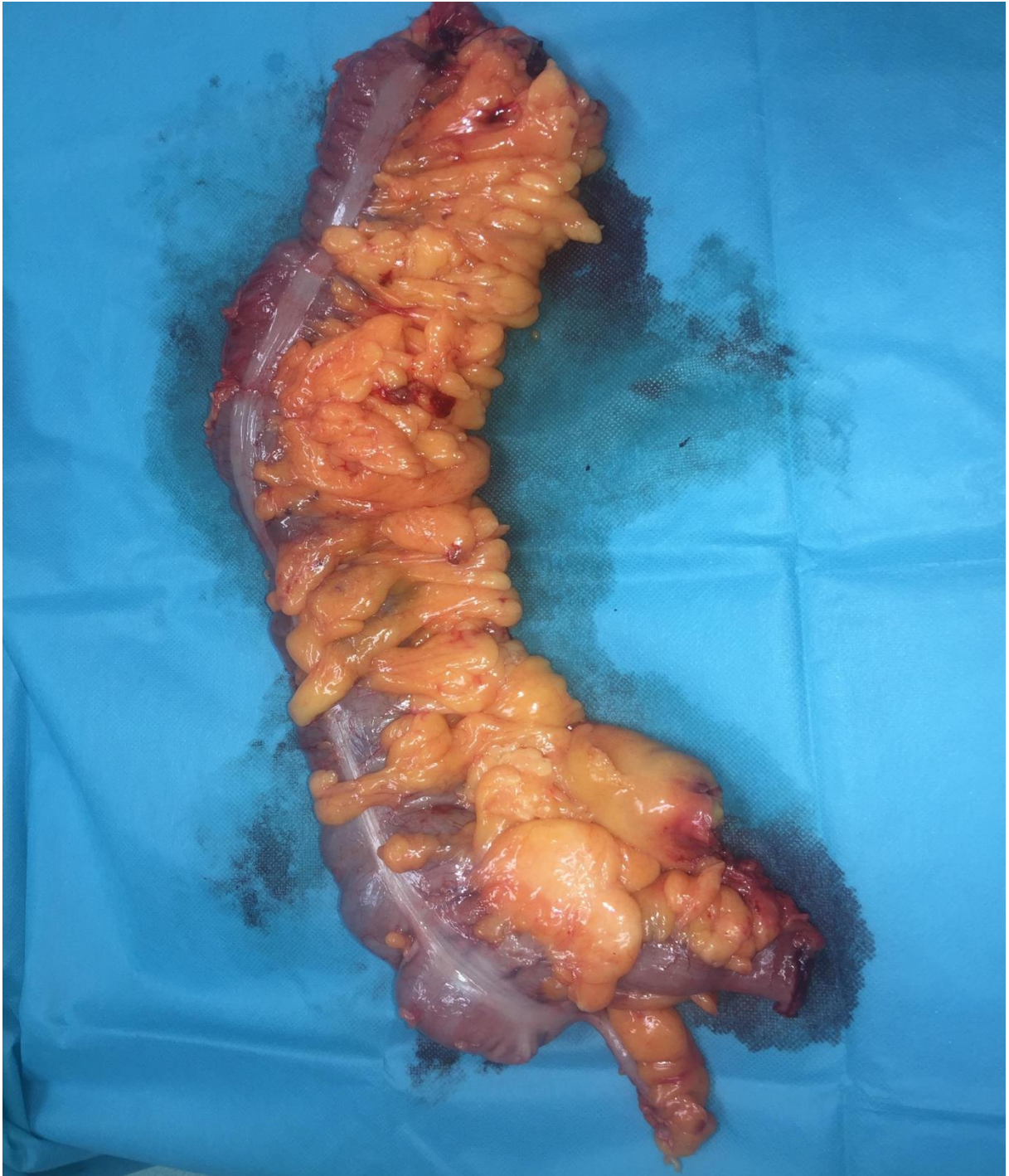
Figure 1: specimen of the hemicolectomy