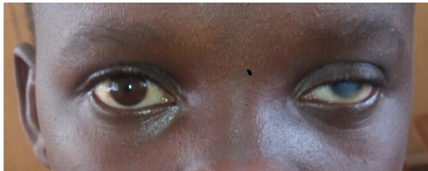
Figure 2: Twelve-year-old girl with normal right eye (VA=10/10) and corneal scar (leucoma) and total cataract in left eye (VA=light perception)

As far as the eligibility process in this school is concerned, they told us that children were admitted upon presentation of a medical certificate of blindness. A meeting with her parents was organized in order to take care of the girl on the one hand, and on the other hand to inform them that she should return to a “normal” school and leave the school for blind children. They did acknowledge that they actually wanted free education for their daughter by sending her in this school for blind children.