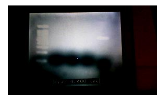
Figure 2: Analysis of DNA fragments amplified

The amplimeters of the CYP2C9 and VKORC1 genes are tested by electrophoresis on agarose gel, the migration is carried out at 150 volts for 30 minutes, the visualization of the migration bands is made under UV by fluorescence with Ethidium Bromide, the size of the expected bands is 690 bp, 130 bp and 636 bp for CYP2C9*2, CYP2C9*3 and VKORC1 respectively. The presence of bands under UV light in the sample wells signifies the presence of amplified DNA.