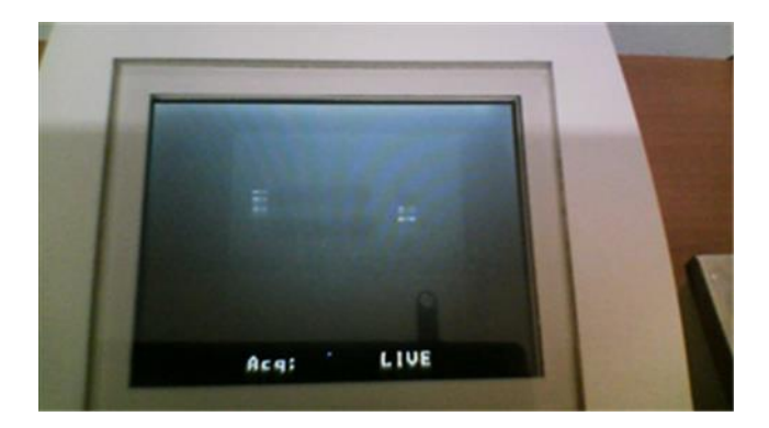
Figure 3: DNA electrophoresis

The rubber gaskets are placed around the edges of the tank, then, the tank is introduced into the electrophoresis tank and the comb is put in its place. 5\mu l of Ethidium Bromide was added to the gel and poured into the vessel, then allowed to gel for half an hour. After gelation, the comb is removed. The electrophoresis tank is immersed in TBE. In the first well, we put 5\mu l of the size marker; in the following wells, we put 10 \mu l of DNA amplified with 5 \mu l of loading buffer. The power generator is set to 120 volts, and then electrophoresis is started