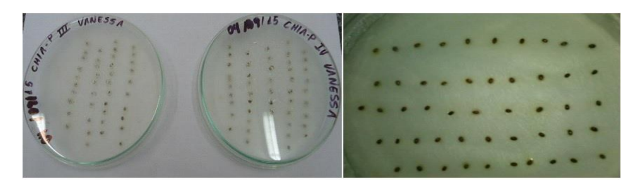
Figure 1: Detection test seeds of Chia.