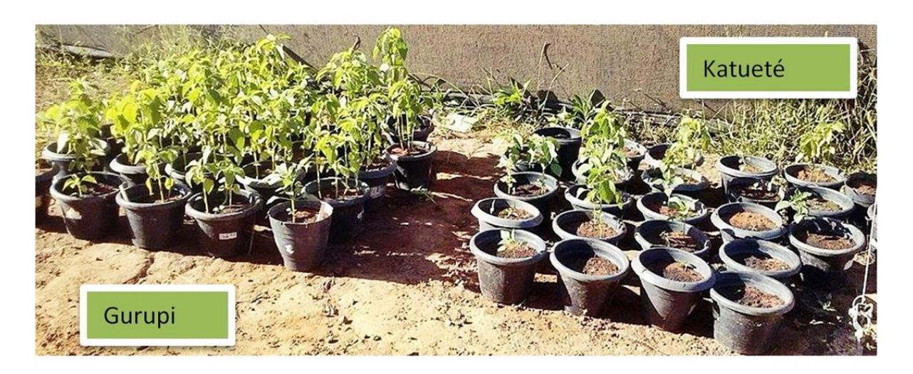
Figure 3: Transmission test on seeds of Salvia hispanica L. from two locations (Gurupi and Katueté).

According to [25], the species of Fusarium are commonly associated with the seeds of various crops, causing loss of germination and vigor, also assisting in complex pathogens that cause topples in plants. Symptoms caused by the fungus Colletotrichum spp. are irregular lesions with light brown to dark brown color accompanied by necrosis of the vein of the leaf. Seeds from the Katueté were subjected to inappropriate storage conditions, thus showing low germinating power seed (11%) can be viewed in Figure 4. Although 89% of the seeds did not germinate, no symptoms of any pathogen in seedlings that germinated and nor was there evidence that the seeds did not germinate. Comparing the two origins of the seeds as the physiological and sanitary quality, it was found that the seeds of Gurupi have better physiological quality and those of Katueté best sanitary quality.