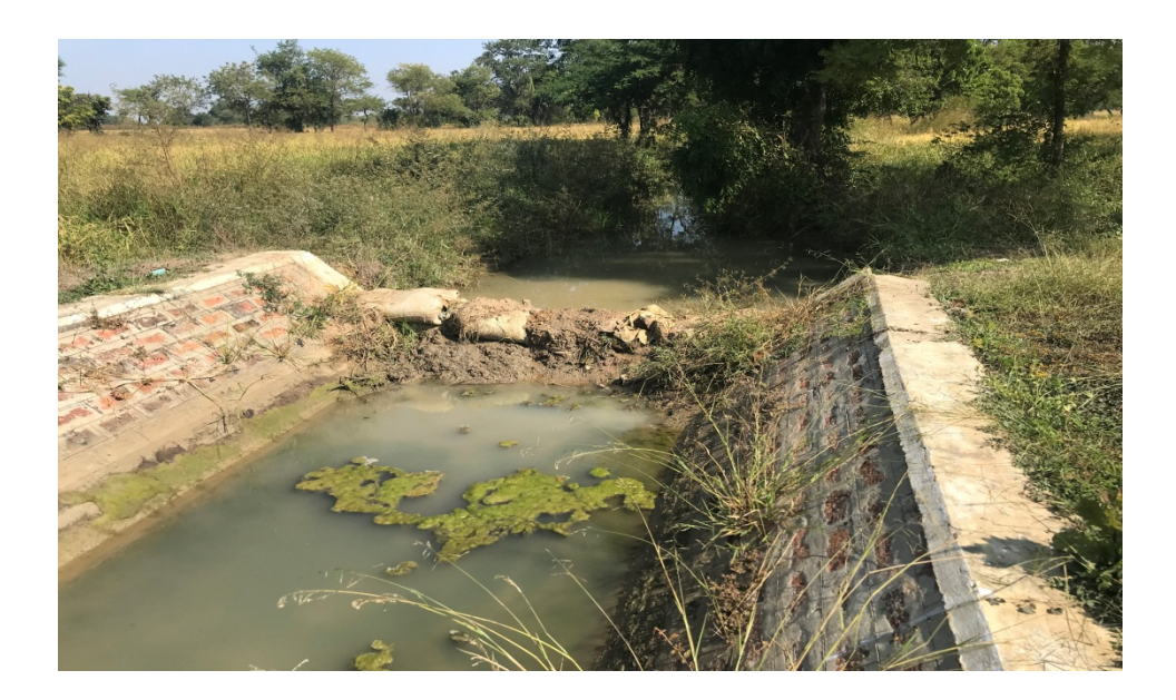
Figure 5: Illegal conveyance means with use of sand bags and wood logs in Kyan Kin Village

As above mentioned points create lack of communication and adequate capacity building for the water user association and member farmers related to Agriculture Water Pricing for Canal Irrigation in Saedawgyi Irrigated area.