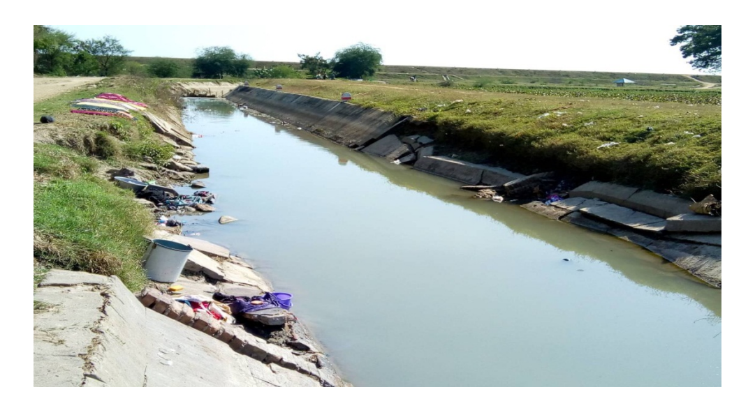
Figure 3: Deterioration of canal Lining in Kyaukthanbet Canal, Mattaya Township, Saedawgyi Irrigated Area

canal system is somewhat limited [4]. The need of a storage dam in the valley had to be seriously considered by the Irrigation Department. The main irrigation infrastructure, including dams, weirs, and the water distribution system to farm level is constructed, operated and maintained by the Irrigation Department (ID). While many reservoirs and irrigation schemes have been built in recent years, some have not been fully developed due to shortfalls in the budget for construction of the canal network and structures. The existing water tariff is very low and does not cover the operating and maintenance cost. This leads to an inadequate funding for the maintenance and rehabilitation of the irrigation infrastructure. Now, most of these structures such as storage tanks, canal lining, tertiary-level canals and field ditches are used for many years and some parts are damaged. This results in insufficiency of water to the fields. The damage of canal lining in the Saedawgyi irrigated area is shown in Figure (3) and (4).