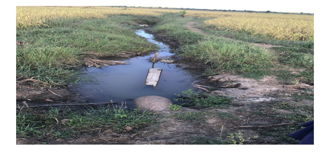
Figure 4: Damage of Field-Ditch Canal in the fields of Pae Hlaw PhoVillage, Mattaya Township, Saedawgyi Irrigated Area

Figure 3: Deterioration of canal Lining in Kyaukthanbet Canal, Mattaya Township, Saedawgyi Irrigated Area