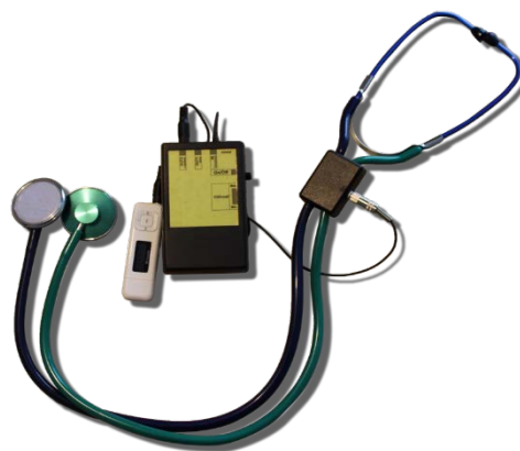
Figure 4: Arthrostereophonendoscope with an electronic recording in MP3 format - our own design

We will do our own examinations by placing the resonance sensors pretrageously over the caput od TMJ and by inviting the patient to open and close the mouth. To accurately determine the prevalence of sound phenomena on one of the sides, we have the ability to alternate the listening of the right and left side, by moving one resonant box away from the face [1].