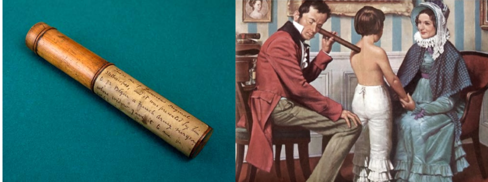
Figure 1: The First Medical Diagnostic Device - Laënnec's Stethoscope and its Illustrative Use [7]

Laënnec had got an idea to roll the sheets of paper into a rigid cylinder. One end was attached to the patient's chest and the other to his ear. After three years of observation and the amount of patient's autopsies (he was able to relate the auscultated sounds and pathology in the body), he published a book, to which there was a possibility to buy a stethoscope [9].