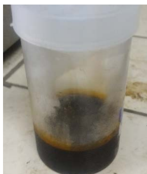
Figure 1: Lemon ( Citrus limon ) peel extract

The lemon ( Citrus limon ) peel extracted with ethanol 96% using maceration extractor are shown on Figure 1.