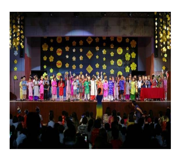
Figure 4: Tet Fair, SSIS

SSIS Idol is annually celebrated on the last Friday of February. The program is a competition between groups and individuals. The fund from selling the tickets (50,000 VND for children tickets and 100,000 VND for adults') is used for the charity 'Vietnam Heart' and heart operation for poor children of Vietnam. Pijama Friday celebrates on the first Friday of March in which pupils do not wear their uniforms. Instead of wearing uniforms