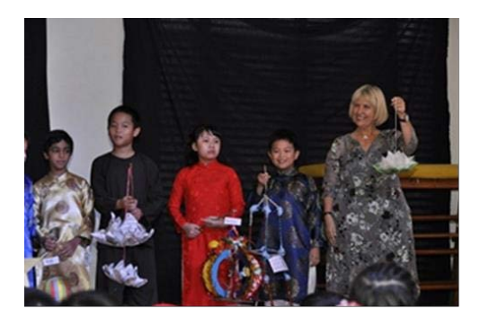
Figure 1: Moon Festival, SSIS

Originating from The World Day, International week celebrated in the last week of October is an important festival of internation schools. It is one of the tradional festivals which is most looked forward to by pupils of these schools. Forms of celebration may change more or less from time to time, however they often have basic acitivites like parade to introduce traditional costumes together with fashion show, introduce music through songs and performances, and introduce cuisine and unique customs of their nations reflecting in games and cultural stalls. To encourage pupils to actively and fully take part in exhibiting cultural stalls, the organizers distribute accumulating signature forms at every stall, at the end of the festival, pupils can exchange the form with gifts. According to the principal of the school, International Week at SSIS is more than just parades and food festivals. It represents an essential part of our school culture.