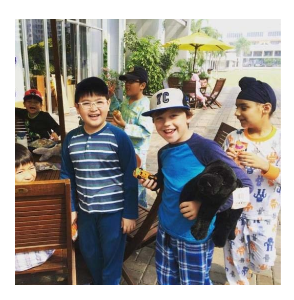
Figure 5: Pijama Friday, SSIS

Earth week (start from 22<sup>nd</sup> April) gives a message of protecting the environment, organic food, avoidance of wasting paper, etc to call for environment preservation. On this day, most pupil and teachers are in green.