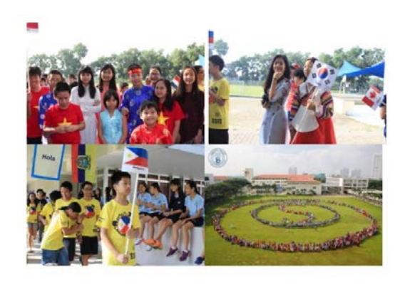
Figure 2: International Week, SSIS

Holloween is celebrated on 31<sup>st</sup> October. Halloween in the short form "All Hallows' Eve", meaning the night of ritual for gods focuses on the topics of 'humour and making fun in order to face the power of death''. On this day, children will disguise themselves in odd costumes, go to knock the door of houses to play tricks and ask for sweets. Halloween of SSIS celebrates with red pumpkin, disguised costumes and foods, with scary horror movies and music, with familiar games such as grasping apples in a water bucket by mouth, matrix games, etc.