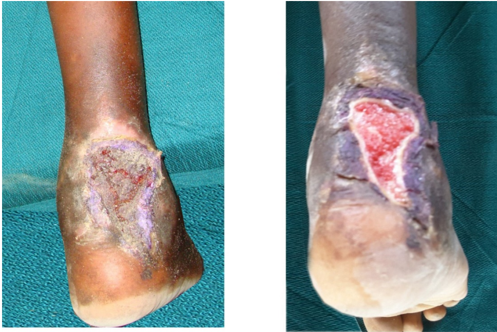
Figure 3: A 6 - month old chronic wound in a child – before and after cleaning