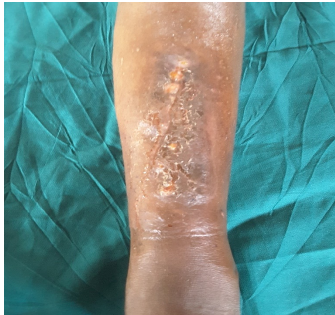
Figure 4: An 18 - month old wound now turned chronic osteomyelitis in a child

Wound healing was achieved in more than half (n=10/19; 52.6%) of the cases by three weeks of commencement of simple wound dressing with local honey. In the others (n=8/10; 42.1%) the healing process was progressing satisfactorily. None of the cases needed referral for more sophisticated dressings or a skin grafting. However the one case (5.3%) with chronic osteomyelitis was referred to a tertiary Health facility for appropriate management.