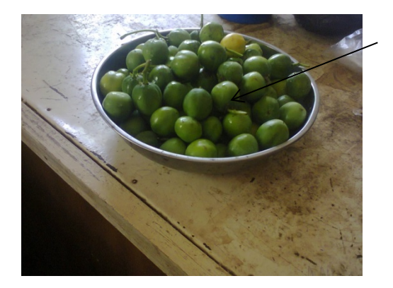
Fresh Physic nuts