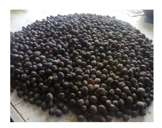
Figure 2: Dried sample of physic nuts

Table 1 shows the summary of Two-way ANOVA on effect of the drying temperatures as a function of time in drying of physic nuts. The effect of temperature was highly significant (p<0.05) and the model F value 38.85 implies that the model is significant. Also, the effect of drying time was not significant as p>0.05. This indicated that temperature is a dependent factor while weight loss and drying time are the response variables. It is obvious that the drying process was enhanced substantially with the increment of the temperature. Similar behavior was reported by several authors; Akendo et al. [28] observed the behavior in dewatering and drying process of water hyacinth petiole. Similar behavior was observed by [29,30,31] as they investigated the drying kinetics of aromatic plants, date palm fruits and garlic slices respectively.