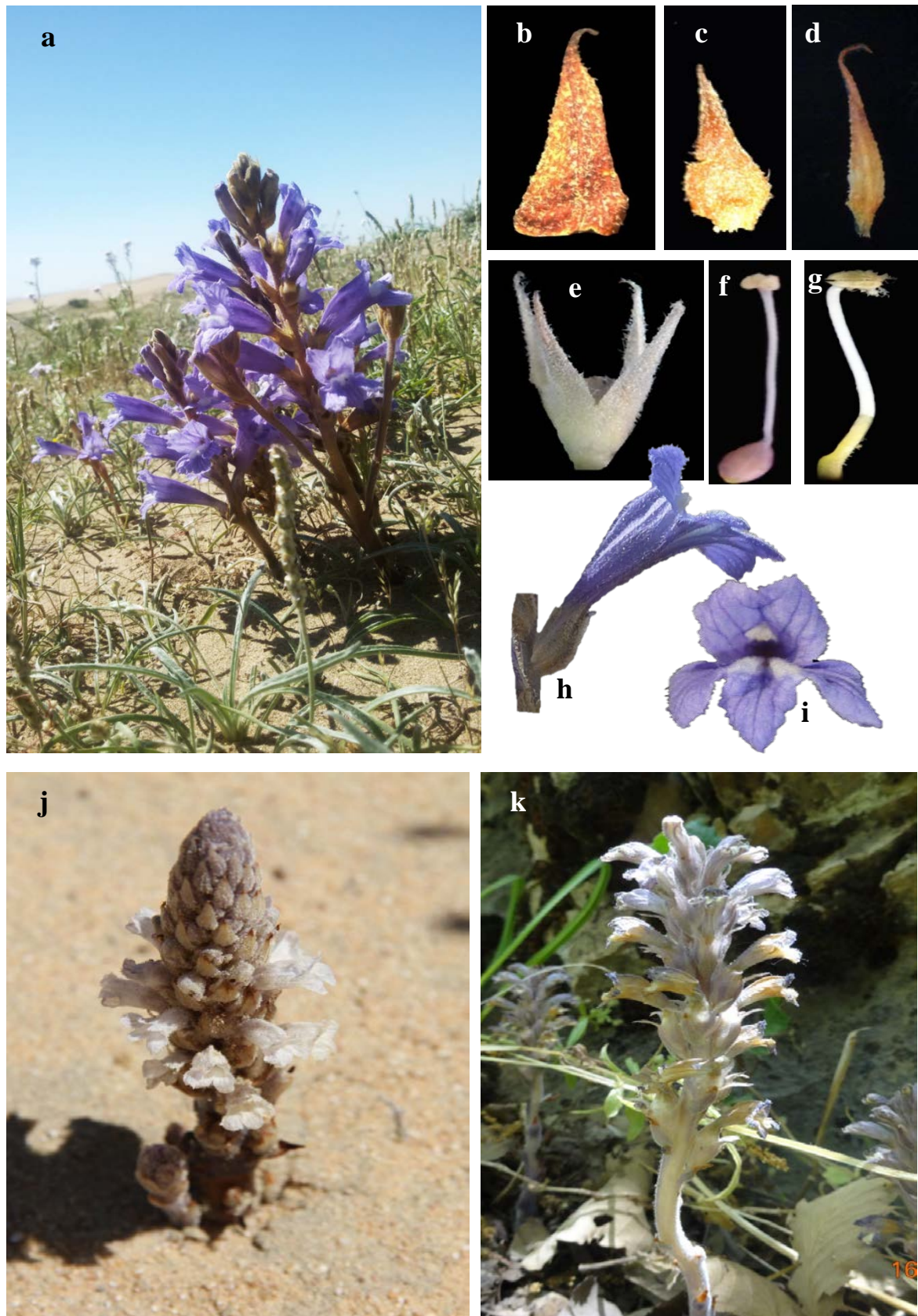
Figure 2: P. aegyptiaca : a, Habit b, Scale c, bract d, bracteole e, calyx f, pistil g, stamen h, flower side view i, corolla front view j, P. umqasrensis k, P. nana