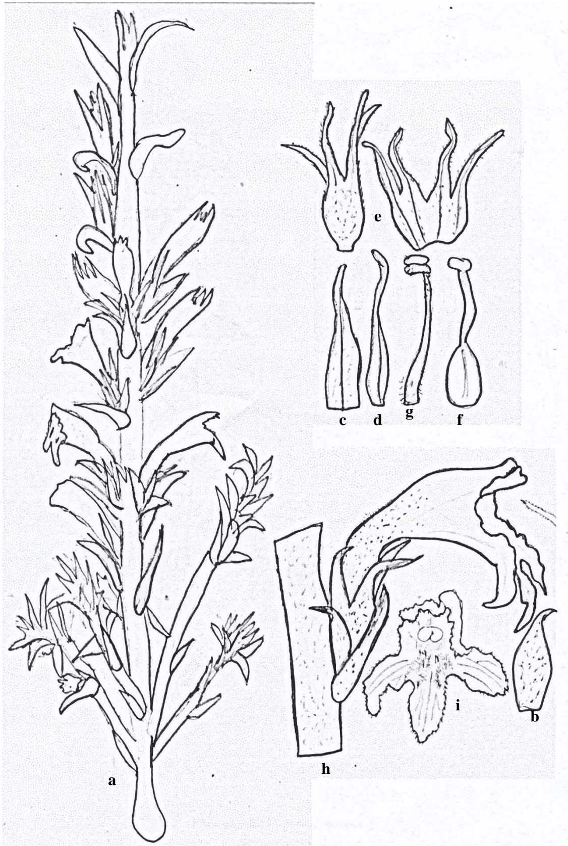
Figure 4: P. orientalis : a, Plant habit b, Scale c, bract d, bracteole e, calyx f, pistil g, stamen h, flower side view i, corolla front view