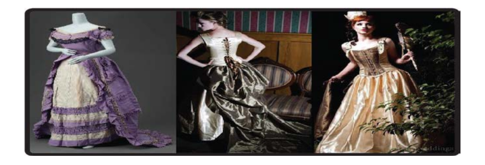
Figure 12: Bustle period costume [51-52]

High, closed, square, round, v shaped opens necklines, low cut in front high at the back of bodice, off the shoulder are commonly used in Bustle period. This neckline also used in modern time [50]