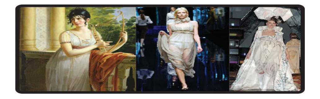
Figure 9: Directories or empire period costume [40-43]

Low cut, round, square, higher necklines, small ruff is used in Directoires and empire period. Now a day it is very trendy fashion of neckline.