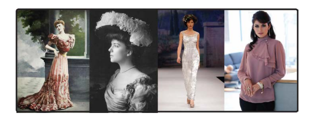
Figure 13: Edwardian period costume [53-56]

High boned collars, square, v shaped sailor collar, low and round neckline is used in daily wear of Edwardian women's.