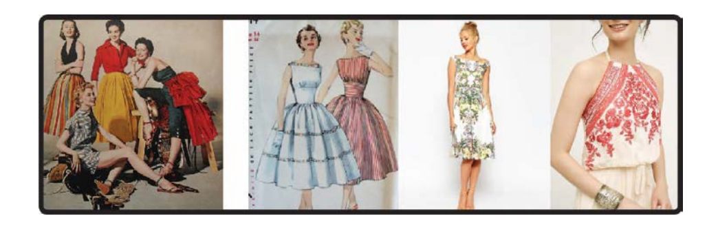
Figure 17: 1950 costumes [69-72]

Scooped, halter v-neck, boat-neck, square-neck, or sweetheart neck is very popular in 1950 for the fashionable lady [68]