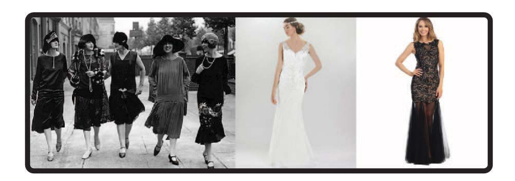
Figure 14: 1920 costumes [57-59]

In 1920 necklines usually ended at the base of the throat or lower, with round, v shaped, and bateau or cowl style.