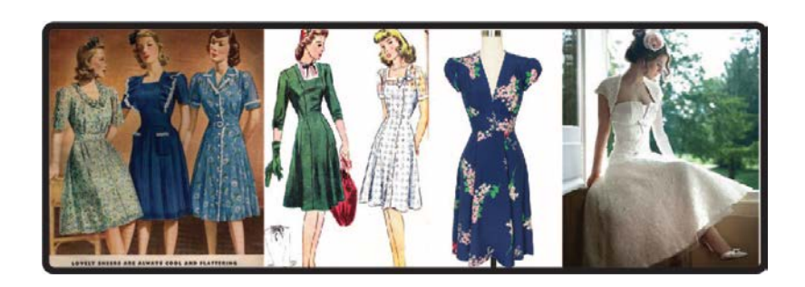
Figure 16: 1940 costumes [64-67]

Boxy or square neckline are very much used in 1940. Necklines could be square, slit, sweetheart, keyhole, shirred, cross front (wrap), or V cut.