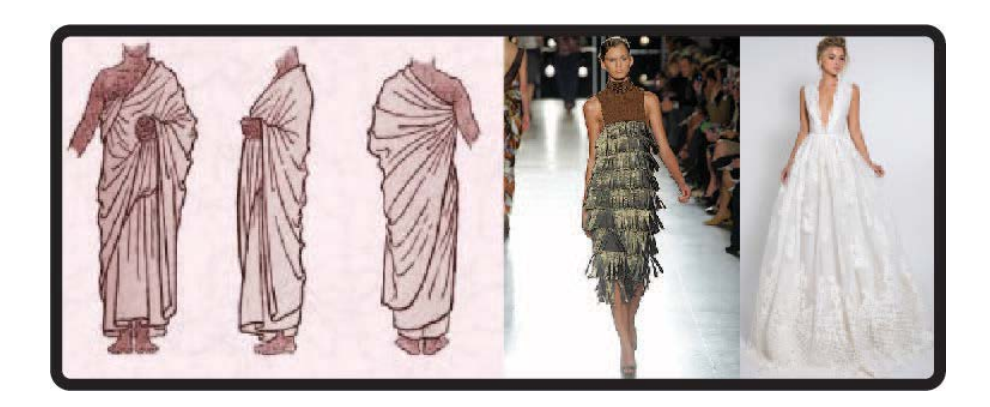
Figure 1: Mesopotamian dress [3-7]

In Mesopotamia most of the women used V necks and round neckline to their daily wear .We can see from Figure 1 that the necklines is repeated in modern dress also. V neck is used because of their draped garments. Actually V and round neckline is common in almost all civilization. Now a day, we can seen the huge implementation of round and V neck in our modern attire.