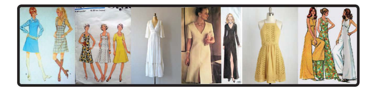
Figure 19: 1970 costumes. [78-86]

Halter neck, high necked, pussy bow collar, Chelsea collar, plunging are mostly used in 1970s.