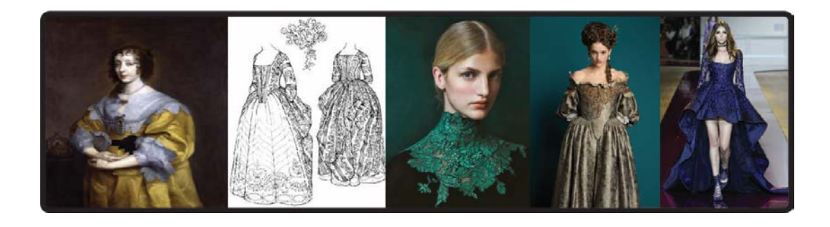
Figure 7: Baroque dress [30] - [34]

In 17th century flowing lace collars, deep necklines are common fashion of necklines. That is also used in modern times.