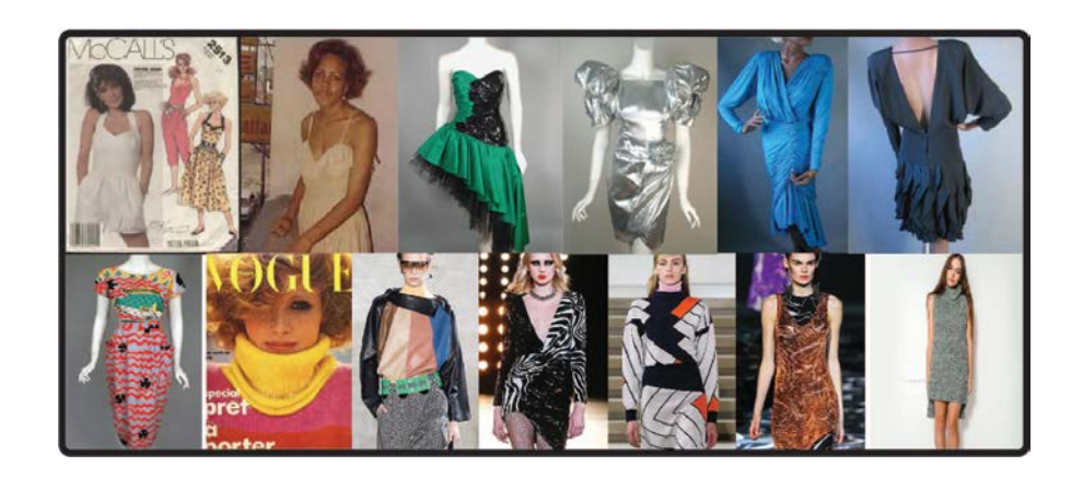
Figure 20: 1980 costumes [87-93]

Turtle neck, V shape collar or some had the crew neck collars in 1980s necklines fashion for women, Which is also the modern fashion of todays.