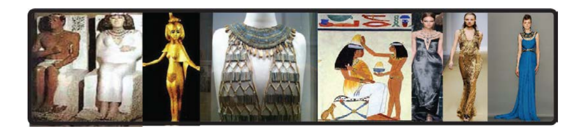
Figure 2: Egyptian Dress [8-13]

In Egyptian period the neckline was either deep or wide, or narrow, converging down to the waist. Some dresses covered only one shoulder, the other shoulder and breast remaining bare, except when concealed behind a light veil or the edge of wrap or cloak. This type of neckline is used today also. It is clearly seen from Figure 2.