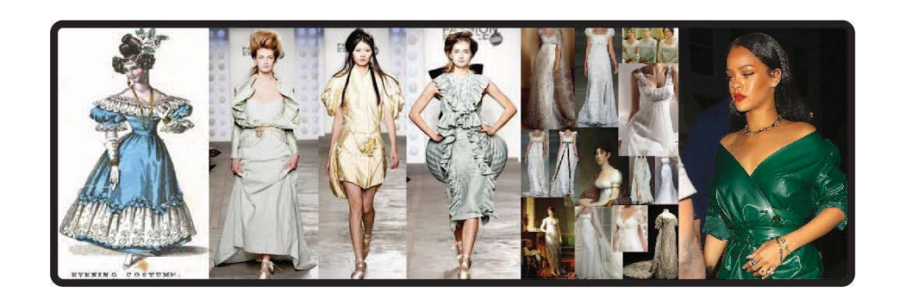
Figure 10: Romantic period costume [44-47]

High, to the throat and finishing off with a small collar or ruff and V shaped neck is very fashionable in Romantic period. It can be seen from some modern picture that those collar also used today's fashion. [44-47]