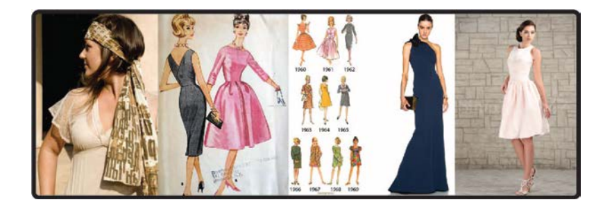
Figure 18: 1960 costumes. [73-77]

In 1960 there are many type of necklines used for women's fashion. Cowl back necklines, boat or bateau necklines, funnel necklines, rounded or jewel necklines, square necklines, sweetheart necklines and plunging necklines are the common version