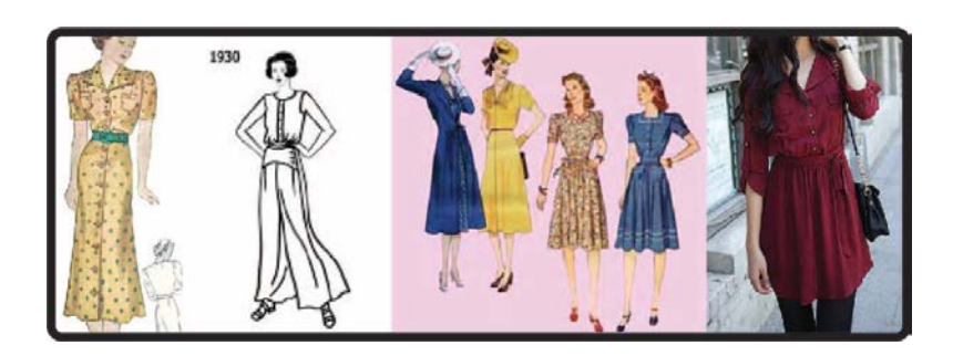
Figure 15: 1930 costumes [60-63]

High, cowl, v neck are the common neckline fashion in 1930s, which is very fashionable now a days.