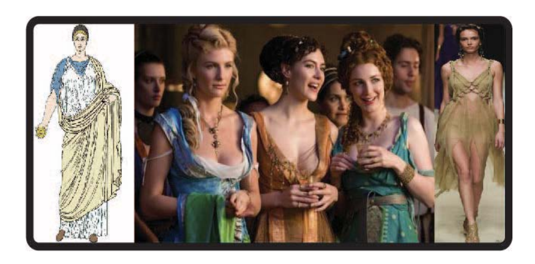
Figure 4: Roman dress [17-20]

In Roman period v-neck effect is commonly seen in women garments. Here I collect some modern version.