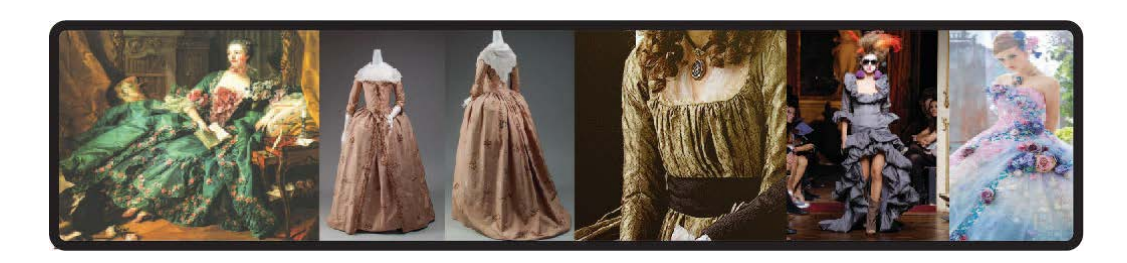
Figure 8: Rococo dress [35] - [39]

In rococo period (18th century) Low, square, oval, Plunging neckline was used. From this picture we can see that those necklines are also used in modern times also. May be it can implement by different ways or different style. But the origin is from ancient period.