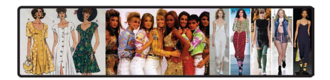
Figure 21: 1990 costumes [94-97]

Plunging neckline, Scooped Neckline, V Neckline is highly used in 1990s fashion which is used in today's fashion also.