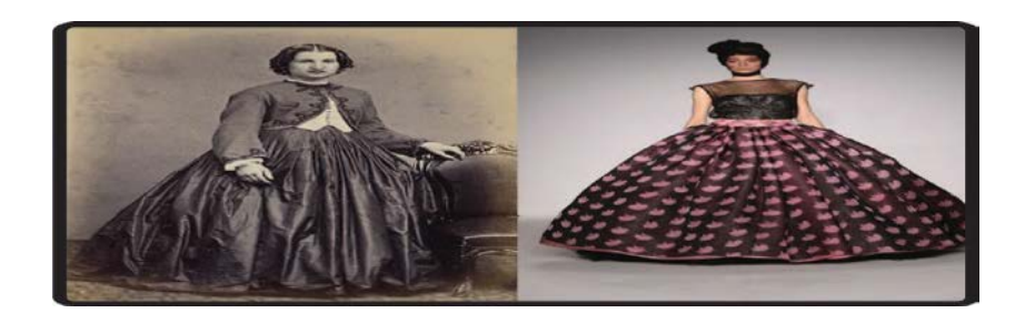
Figure 11: Crinoline period costume [48-49]

High, without attach collar, finished in bias piping are the variation of necklines in crinoline period.