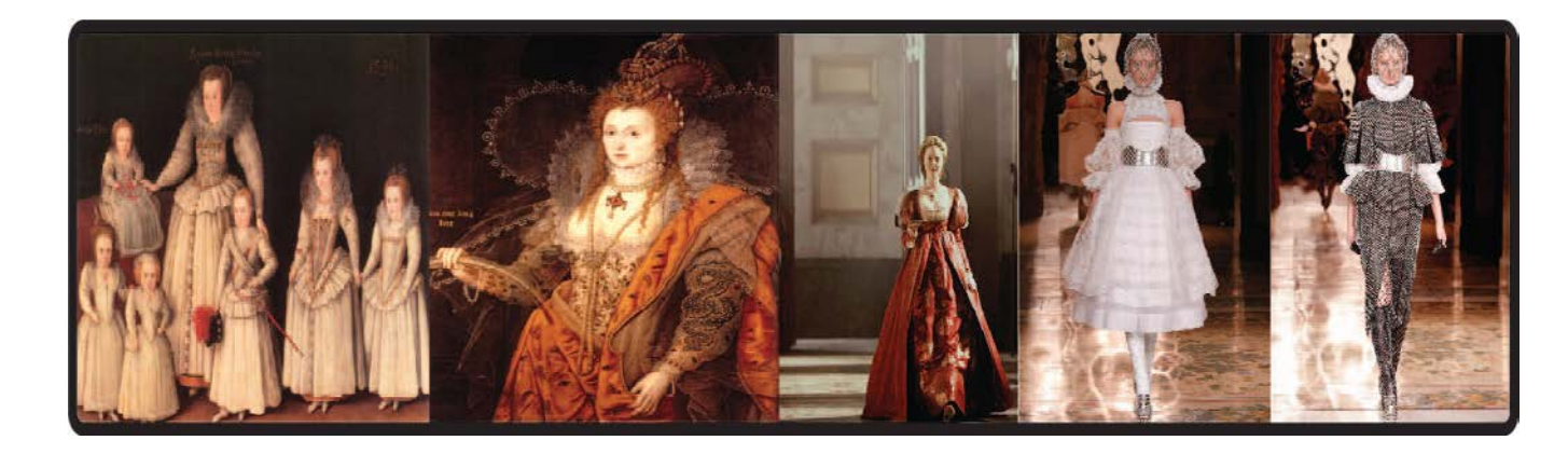
Figure 6: Renaissance dress [26-29]

In Renaissance (both early Renaissance & High Renaissance) high or low neckline is used . Low necklines were popular at the beginning but toward the end of Elizabeth's reign, necklines were high. Alexgander MaQueen also represents that high collar ruff in his Fashion show.