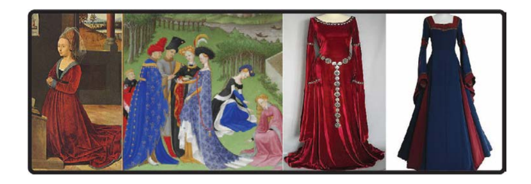
Figure 5: Middle age dress [21-25]